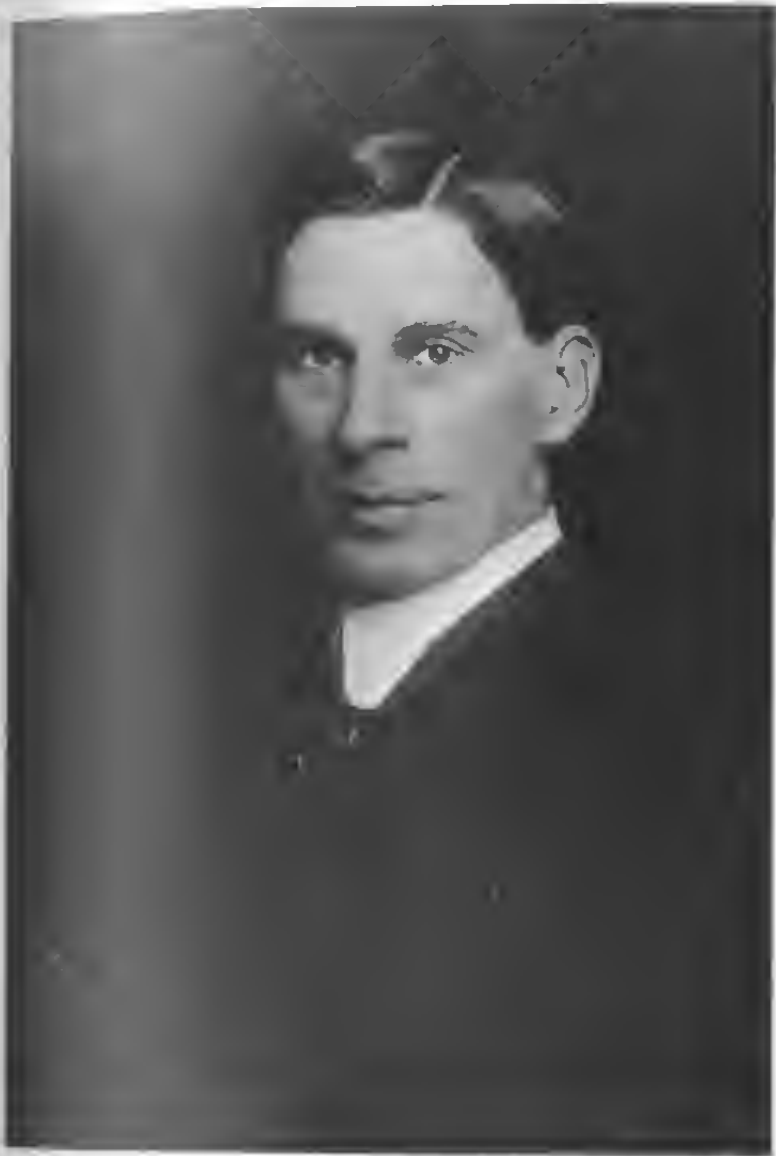
Ray Lyman Wilbur